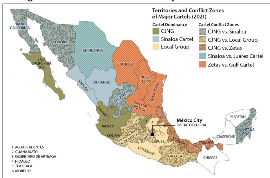
Figure 2. 2021 Mexican Cartel Territory and Conflict Zones

Figure 2 maps the territories dominated and disputed by major cartels from data gathered by Latin America regional analyst James Bosworth from open sources and journalist interviews. The figure shows five major competitors or large cartels: CJNG, Sinaloa, Juárez, Gulf, and Los Zetas, each by their areas of dominance and contested areas. Local group challenges shown in central and western Mexico come from cartel fragments or new offshoots of groups that are among the nine organizations profiled in this report, such as La Familia Michoacana . For another way to envision the TCO territories and conflicts, the political risk firm Stratfor Worldview (previously Stratfor) provides a geographic mapping (see Figure 3 ) of Mexico's 12 major cartels. This depiction has evolved from a previous Stratfor conceptualization of cartel territories within regional groupings.